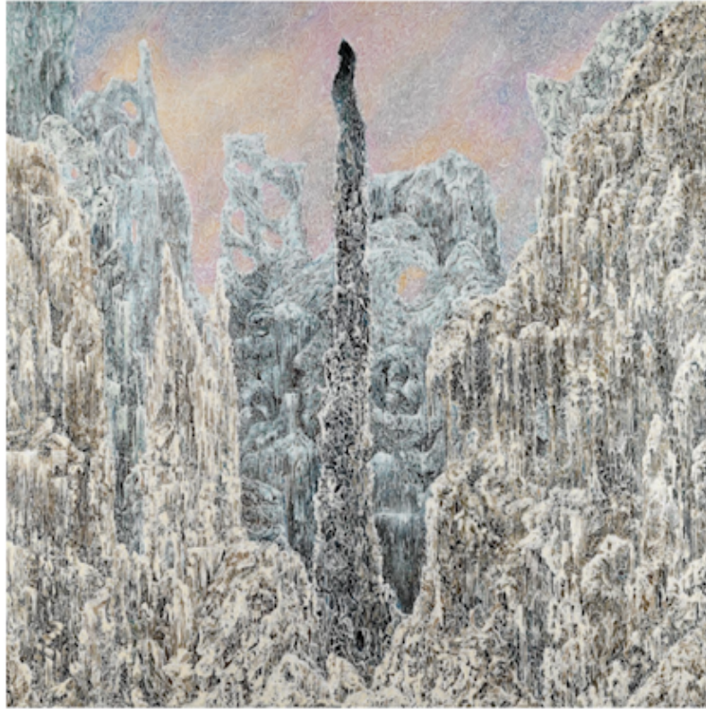
Manolis Anastasakos, Mount Meru, 160x160, Acrylic on canvas.

The 'Mythos' series is a reflection of our world and our inner selves, seen through the prism of mankind's epic tales, since the beginning of time and across the globe. Anastasakos has selected myths from the Near East, Egypt, China and of course Greece. Christian iconography is also part of this work. Each myth is depicted in detailed design, indulging the viewer in a game of motifs and hidden meanings. He started producing these art works in 2014 and continues until today. He regards this work as the epitome of a philosophical quest as an artist and a human being, meaning that the research for it has been undergoing for much longer.